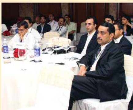
Participants at India Roads 2009